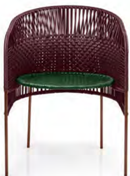
black red/moss green/copper 01ACADC-Q