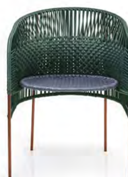
moss green/dark blue/copper 01ACADC-R