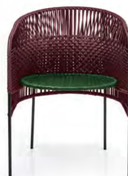
black red/moss green/black 01ACADC-M