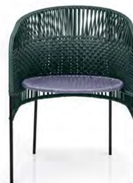
moss green/dark blue/black 01ACADC-P