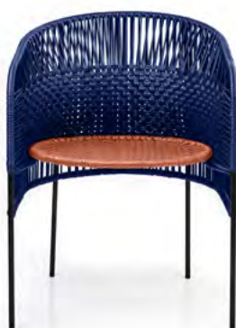
dark blue/copper/black 01ACADC-J