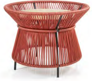
crema nuova/copper/black 01ACAMB-D