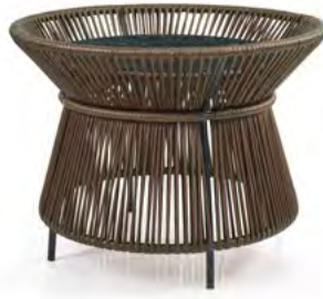
verde guatemala/terra/black 01ACAMB-C