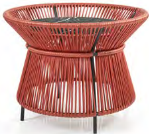
nero marquinia unito/copper/black 01ACAMB-B