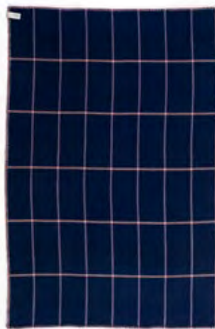
grey/chalk pink/marine blue 00AMA34