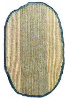
moss green/light blue/blue green 00AUR2-C