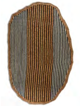
blush pink/black/goldcooper 00AUR4-2