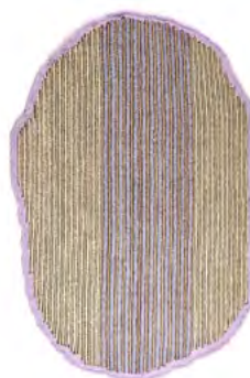
blue lila/blue lila/red ochre 00AUR2-B