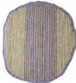
blue lila/blue lila/red ochre 00AUR1-B