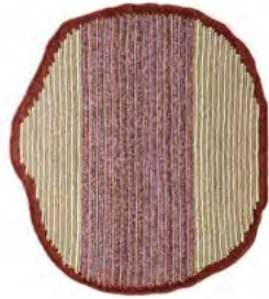
picante red/warm sand/viola 00AUR1-A