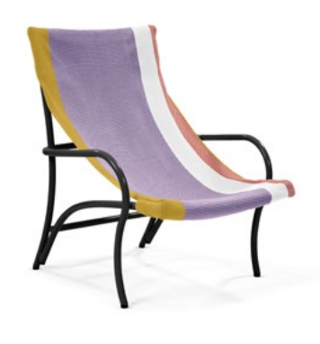
gold/purple/red/ black 01AHLC-D