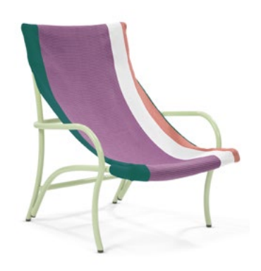
turquoise green/purple/red/ pastel green 01AHLC-A