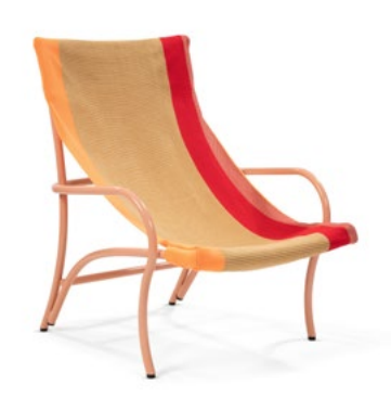
orange/gold/red/ pink sand 01AHLC-C