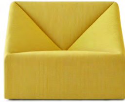
yellow/ocre/light green 00AMRF1-B