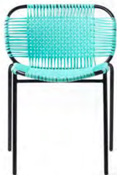
light green/black 00ACSC-2