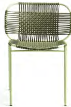
olive green/pastel green 00ACSC-4