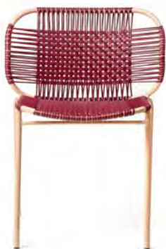
red/pink sand 00ACSC-5