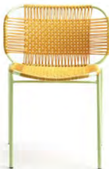
honey yellow/pastel green 00ACSC-6