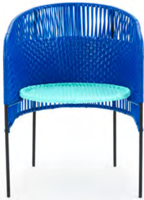
signal blue/ turquoise/black 01ACADC-B