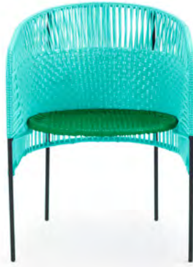
turquoise/ emerald green/black 01ACADC-C