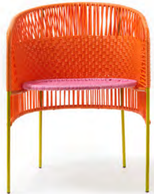
orange/ bubblegum rose/curry yellow 01ACADC-E