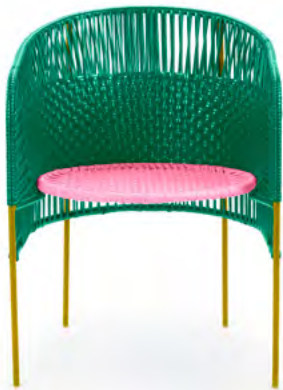
emerald green/ bubblegum rose/curry yellow 01ACADC-F