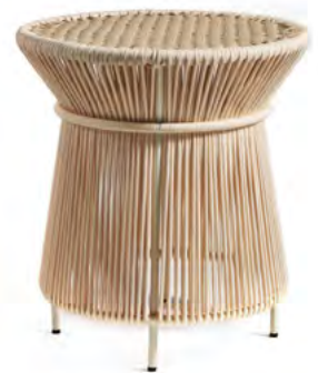
pastel beige/beige/pearl white 01ACAHT-V