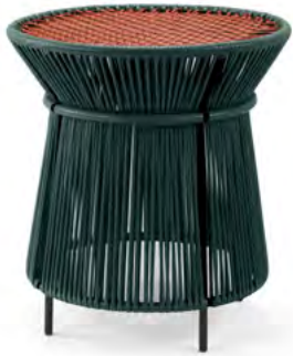
moss green/copper/black 01ACAHT-I