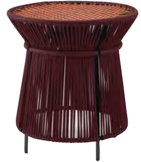
black red/copper/black 01ACAHT-N