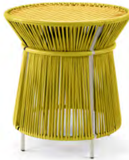
curry yellow/honey yellow/ pearl white 01ACAHT-U