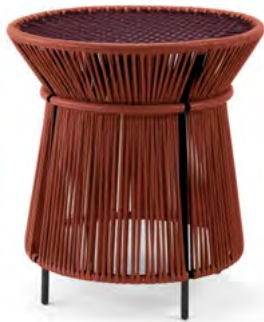
copper/black red/black 01ACAHT-O