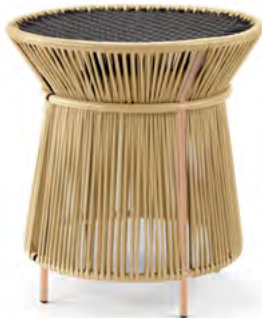
beige/black/beige pink 01ACAHT-W