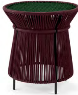
black red/moss green/black 01ACAHT-M