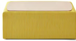
yellow/ocre/light green 00AMRF3-B