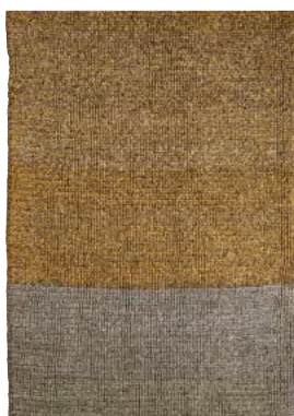
greenrose/ light grey melange 00AFR7-E