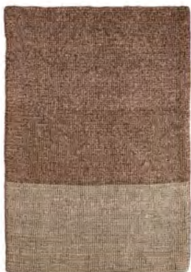
cacao melange/ brown melange 00AFR7-A