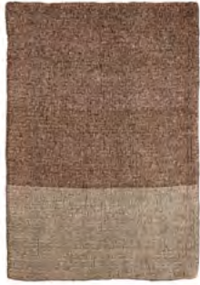
cacao melange/ brown melange 00AFR5-A