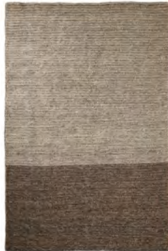
light grey melange/ brown melange 00AFR6-B