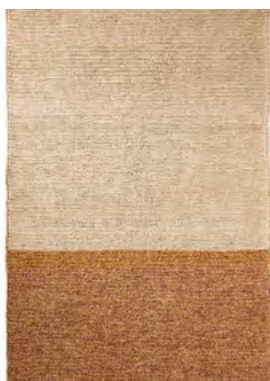
natural rose/ terracotta yellow melange 00AFR7-D