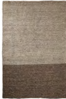
light grey melange/ brown melange 00AFR5-B