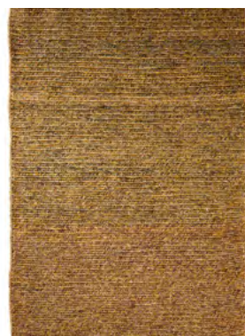
greenrose /terracotta yellow melange 00AFR7-C