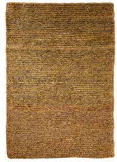
greenrose /terracotta yellow melange 00AFR5-C