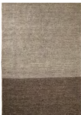
light grey melange/ brown melange 00AFR7-B