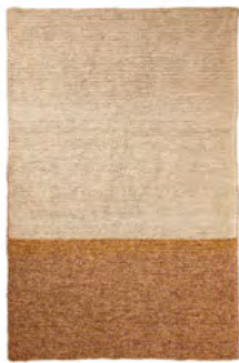
natural rose/ terracotta yellow melange 00AFR5-D