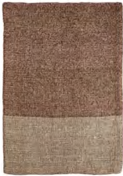
cacao melange/ brown melange 00AFR6-A