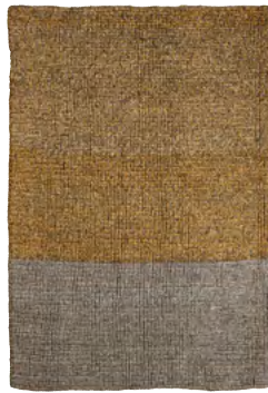
greenrose/ light grey melange 00AFR6-E