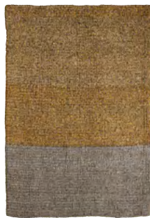
greenrose/ light grey melange 00AFR5-E