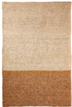
natural rose/ terracotta yellow melange 00AFR6-D