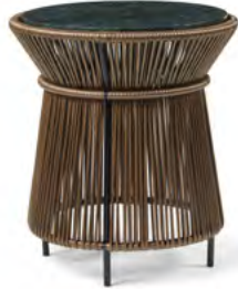
verde guatemala/terra/black 01ACAMH-C