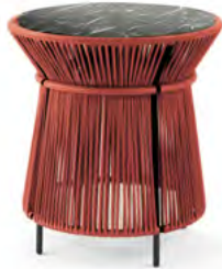
nero marquinia unito/copper/black 01ACAMH-B