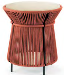
crema nuova/copper/black 01ACAMH-D