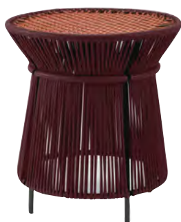
black red/copper/black 01ACAHT-N