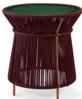
black red/moss green/copper 01ACAHT-Q