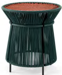
moss green/copper/black 01ACAHT-I