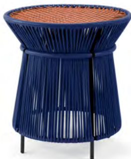
dark blue/copper/black 01ACAHT-J