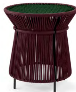
black red/moss green/black 01ACAHT-M