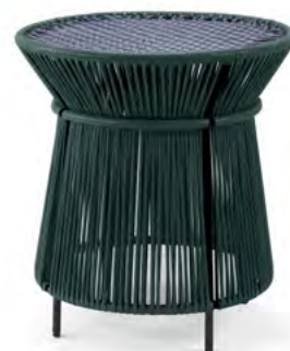
moss green/dark blue/black 01ACAHT-P