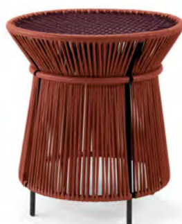
copper/black red/black 01ACAHT-O