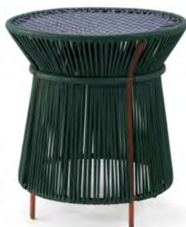
moss green/dark blue/copper 01ACAHT-R