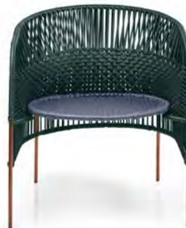
moss green/dark blue/copper 01ACALC-R