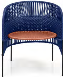
dark blue/copper/black 01ACALC-J