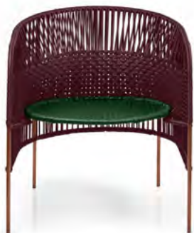
black red/moss green/copper 01ACALC-Q