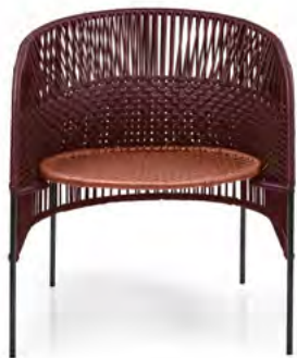
black red/copper/black 01ACALC-N