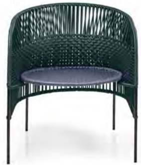
moss green/dark blue/black 01ACALC-P