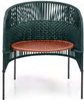
moss green/copper/black 01ACALC-I