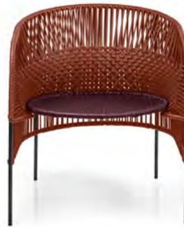
copper/black red/black 01ACALC-O