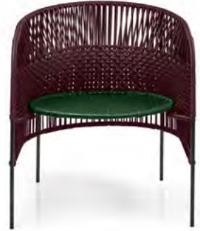
black red/moss green/black 01ACALC-M