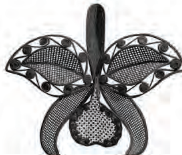
black grey 00AWDF3-E