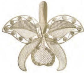
raw natural 00AWDF2-A