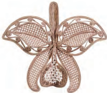
rose dust 00AWDF3-D