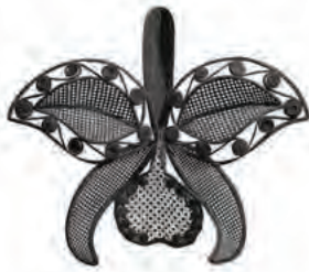
black grey 00AWDF2-E