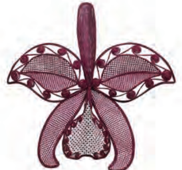
purple red 00AWDF3-C