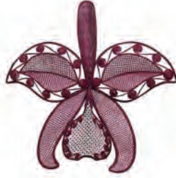
purple red 00AWDF2-C