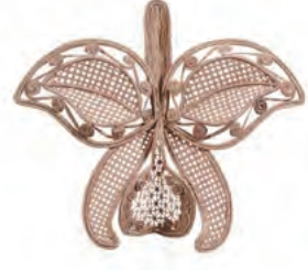
rose dust 00AWDF2-D