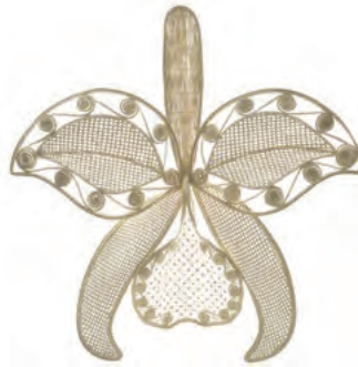
raw natural 00AWDF3-A