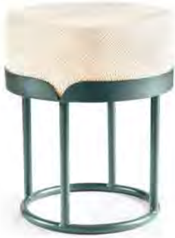
dark natural 00ACoft2P-A