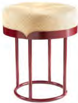
dark natural 00ACoft3P-A