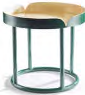
moss green/curry yellow 00ACoft2-2