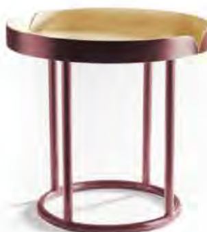
purple red/curry yellow 00ACoft3-4