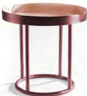
purple red/pink sand 00ACoft3-3