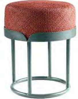
light brown 00ACoft2P-C