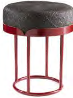
black grey 00ACoft3P-B