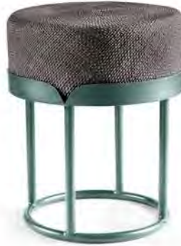
black grey 00ACoft2P-B