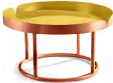
cooper/curry yellow 00ACoft1-5