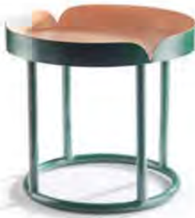
moss green/pink sand 00ACoft2-1