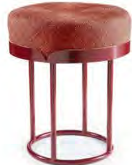
light brown 00ACoft3P-C