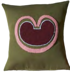
olive green/purple red 00ANIPM2-M