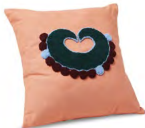
light coral/olive green 00ANIPM1-O