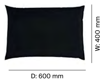
Coraz 2, Piqui 2