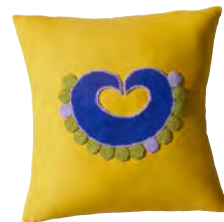
honey yellow/marine blue 00ANIPM1-S