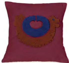
red ochre/red ochre/marine blue OOANIPPT