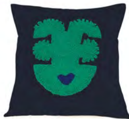
night blue/green/marine blue 00ANIPQN