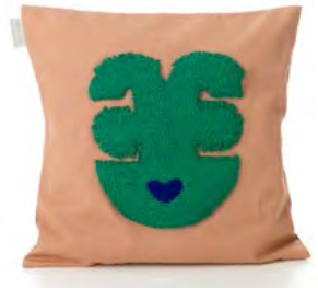
beige pink/green/marine blue 00ANIPQP