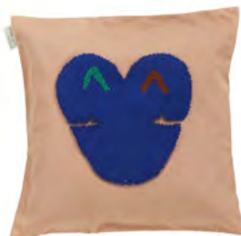
beige pink/marine blue/green/ red ochre OOANIPKP