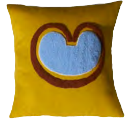
honey yellow/light blue 00ANIPM2-S