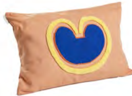
salmon/marine blue 00ANIPM4-O