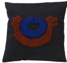
night blue/red ochre/marine blue OOANIPPN