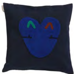
night blue/marine blue/green/ red ochre OOANIPKN