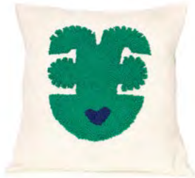
raw natural/green/marine blue 00ANIPQE