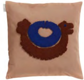
beige pink/red ochre/marine blue OOANIPPP