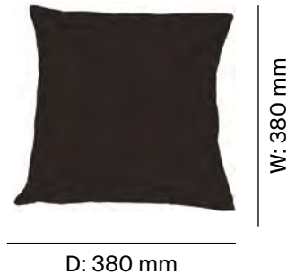
Kukuy, Pichu, Qeztal