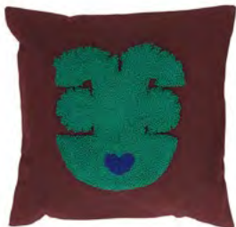
red ochre/green/marine blue 00ANIPQT