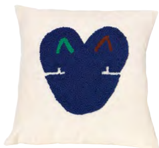
raw natural/marine blue/green/ red ochre OOANIPKU