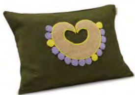
olive green/beige 00ANIPM3-M