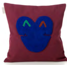
red ochre/marine blue/green/ red ochre OOANIPKT