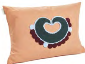
light coral/olive green 00ANIPM3-O