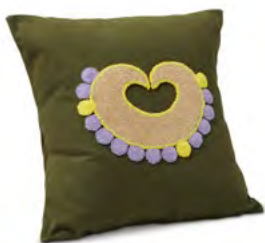
olive green/beige 00ANIPM1-M