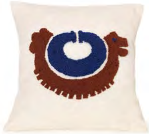
raw natural/red ochre/marine blue OOANIPPI