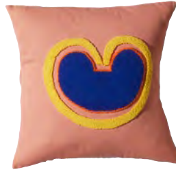
salmon/marine blue 00ANIPM2-O