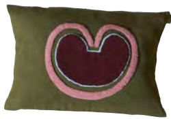
olive green/purple red 00ANIPM4-M