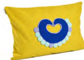
honey yellow/marine blue 00ANIPM3-S