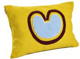
honey yellow/light blue 00ANIPM4-S