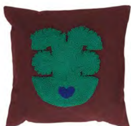
red ochre/green/marine blue 00ANIPQT