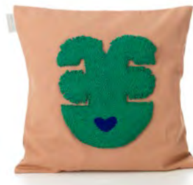
beige pink/green/marine blue 00ANIPQP