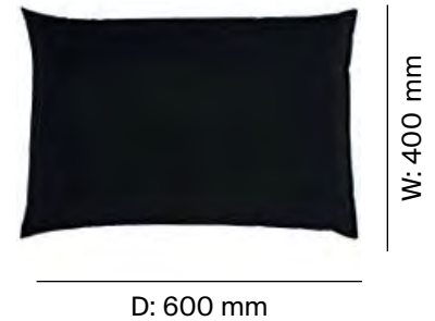
Coraz 2, Piqui 2