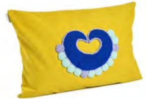
honey yellow/marine blue 00ANIPM3-S