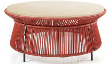
crema nuova/copper/black 01ACAML-D