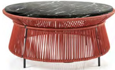
nero marquinia unito/copper/black 01ACAML-B