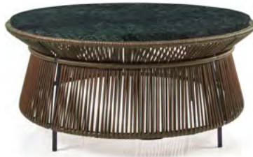
verde guatemala/terra/black 01ACAML-C