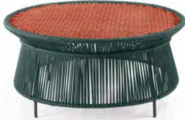
moss green/copper/black 01ACALT-I