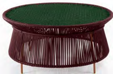
black red/moss green/copper 01ACALT-Q