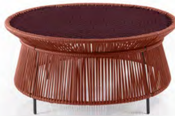
copper/black red/black 01ACALT-O