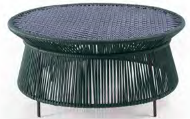
moss green/dark blue/black 01ACALT-P