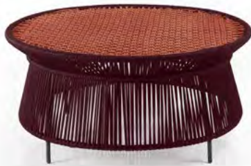
black red/copper/black 01ACALT-N