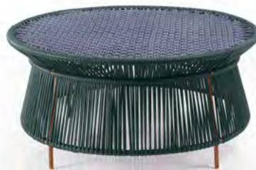
moss green/dark blue/copper 01ACALT-R