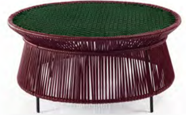
black red/moss green/black 01ACALT-M