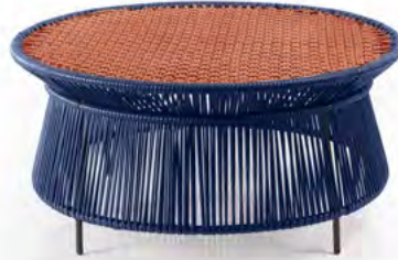
dark blue/copper/black 01ACALT-J