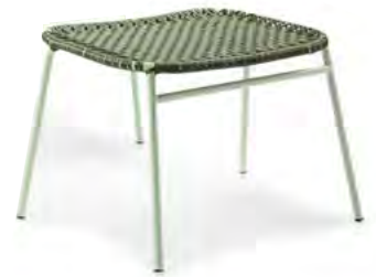
olive green/pastel green 00ACFS-4