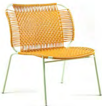
honey yellow/pastel green 00ACLC1-6