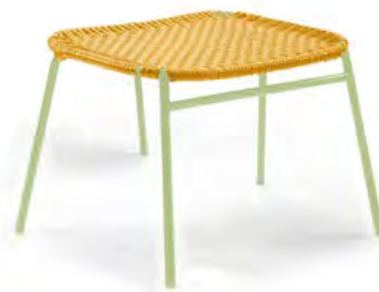
honey yellow/pastel green 00ACFS-6