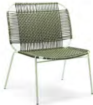
olive green/pastel green 00ACLC1-4