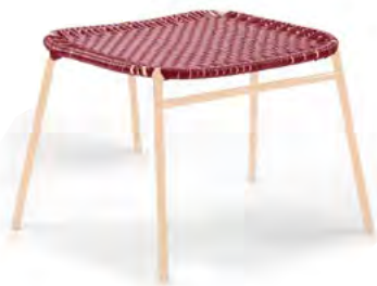
red/pink sand 00ACFS-5