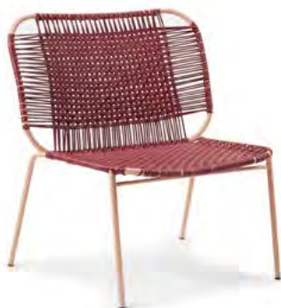
red/pink sand 00ACLC1-5