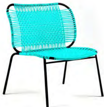
light green/black 00ACLC1-2