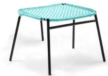
light green/black 00ACFS-2