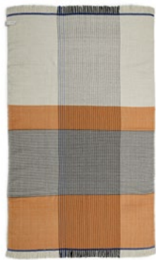
zink yellow/grey/marine blue 00ARU13