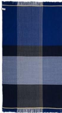
marine blue/black/yellow 00ARU23