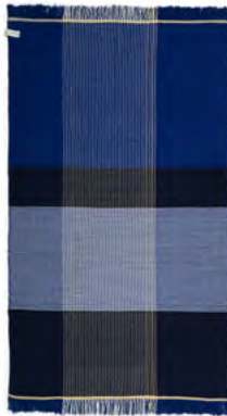
marine blue/black/yellow 00ARU23