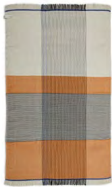
zink yellow/grey/marine blue 00ARU13