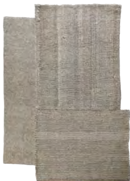
dark natural 00AFR2-A