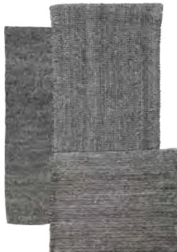
shadow grey/white 00AFR2-B