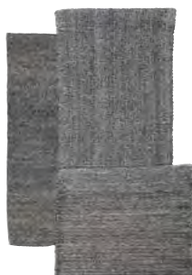
shadow grey/white 00AFR1-B