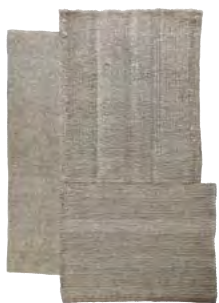
dark natural 00AFR1-A