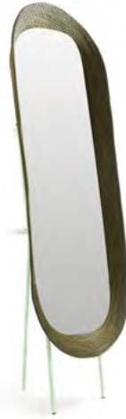
olive green/pastel green 00AMK4-8