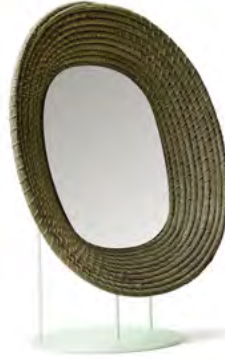
olive green/pastel green 00AMK3-8