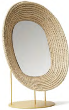
raw natural/yellow 00AMK3-1