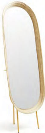
raw natural/yellow 00AMK4-1