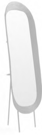
purple red/dark red/dark red 00AMK4-3