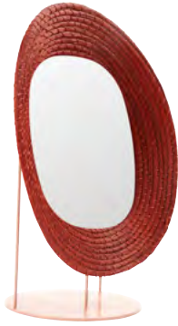
terracotta/pink sand 00AMK3-7