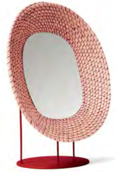
purple red/dark red/dark red 00AMK3-3