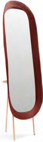
terracotta/pink sand 00AMK4-7