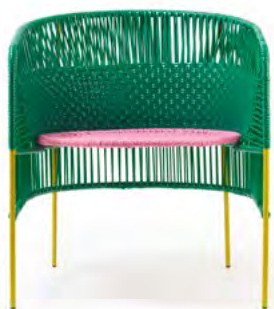
emerald green/ bubblegum rose/curry yellow 01ACALC-F