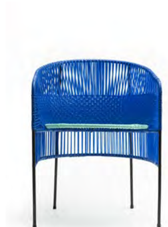
signal blue/ turquoise/black 01ACALC-B