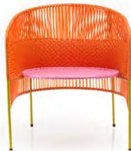
orange/ bubblegum rose/curry yellow 01ACALC-E