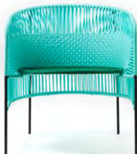
turquoise/ emerald green/black 01ACALC-C