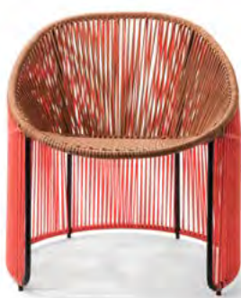
coral/caramel brown/black 00ACARLC-B