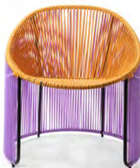
lilac/honey yellow/black 00ACARLC-E