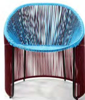
purple/pastel blue/black 00ACARLC-C