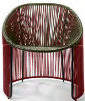
purple/olive green/black 00ACARLC-D