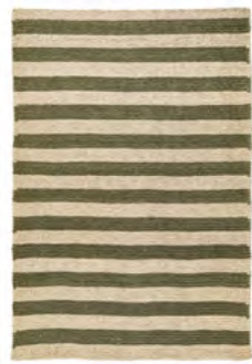
olive green/dark flax 00AFR9-D