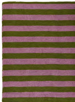
pink/fresh green 00AFR10-E