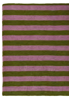
pink/fresh green 00AFR9-E