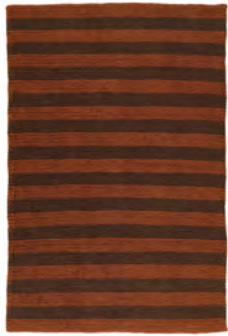
brownish purple/rust 00AFR9-A