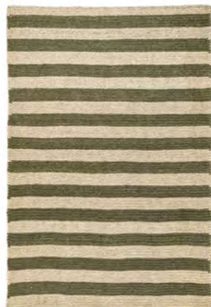
olive green/dark flax 00AFR11-D