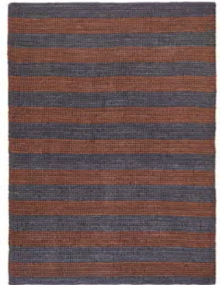
black/brownish purple 00AFR11-C