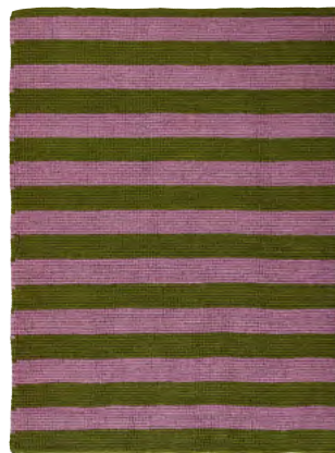
pink/fresh green 00AFR11-E