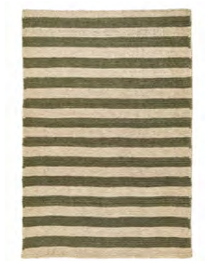
olive green/dark flax 00AFR10-D