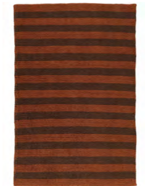
brownish purple/rust 00AFR10-A