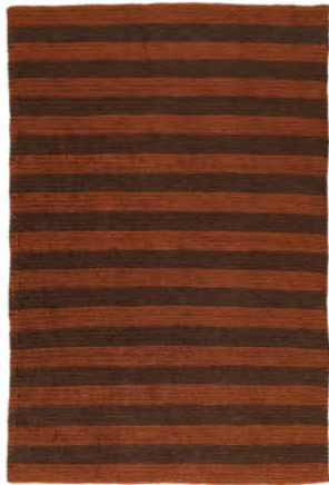
brownish purple/rust 00AFR11-A