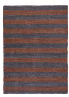
black/brownish purple 00AFR9-C