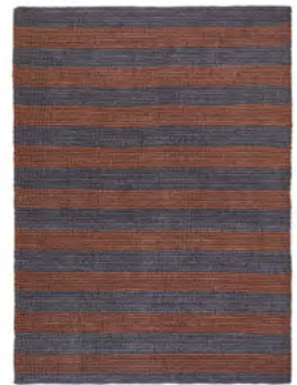
black/brownish purple 00AFR10-C