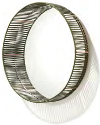
olive green/pink sand 00AMC1-1