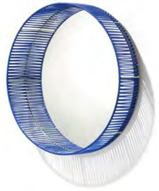
blue/pastel green 00AMC1-3