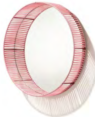
bubblegum rose/rumba red 00AMC1-5