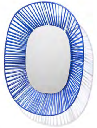
blue/pastel green 00AMC2-3