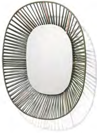
olive green/pink sand 00AMC2-1