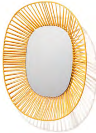
honey yellow/yellow 00AMC2-2