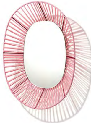
bubblegum rose/rumba red 00AMC2-5