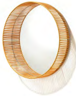
honey yellow/yellow 00AMC1-2