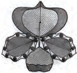
black grey 00AWDF4-E