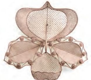
rose dust 00AWDF4-D