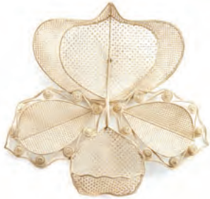
raw natural 00AWDF4-A