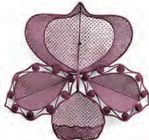
purple red 00AWDF4-C