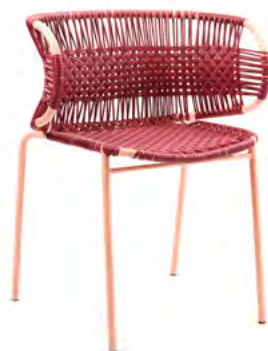
red/pink sand 00ACSCA-5