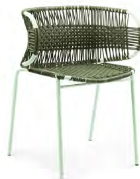
olive green/pastel green 00ACSCA-4