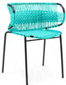
light green/black 00ACSCA-2