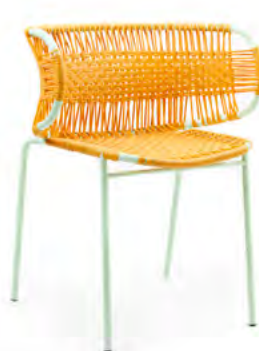
honey yellow/pastel green 00ACSCA-6