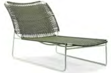
olive green/pastel green 00ACDB-4