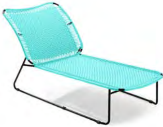
light green/black 00ACDB-2