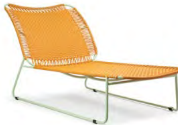
honey yellow/pastel green 00ACDB-6