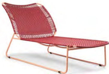
red/pink sand 00ACDB-5