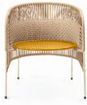
pastel beige/beige/pearl white 01ACALC-V