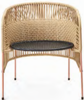
beige/black/beige pink 01ACALC-W