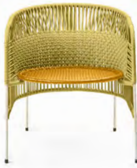
curry yellow/honey yellow/ pearl white 01ACALC-U