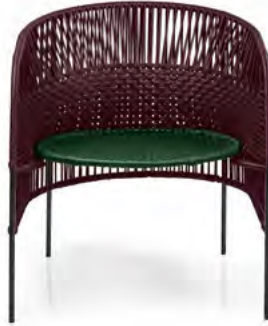
black red/moss green/black 01ACALC-M