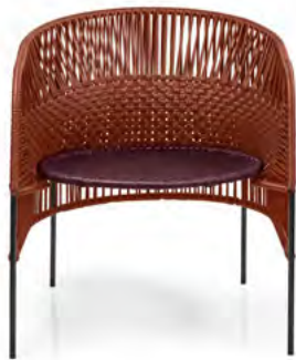
copper/black red/black 01ACALC-O