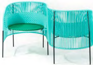
turquoise/ emerald green/black 01ACAVAV-C