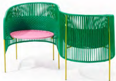
emerald green/ bubblegum rose/curry yellow 01ACAVAV-F