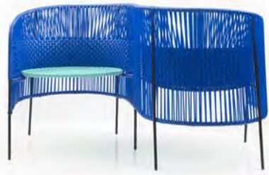
signal blue/ turquoise/black 01ACAVAV-B