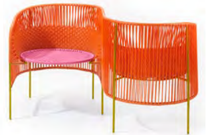
orange/ bubblegum rose/curry yellow 01ACAVAV-E