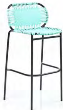
light green/black 00ACBS-2