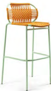
honey yellow/pastel green 00ACBS-6