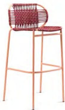
red/pink sand 00ACBS-5