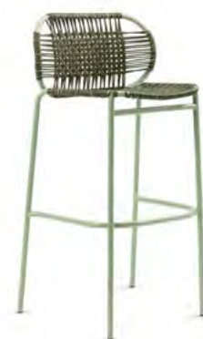
olive green/pastel green 00ACBS-4