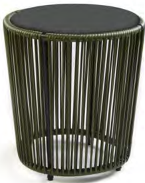
olive green/black/black 00ACARHT-D