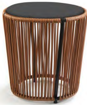
caramel brown/black/black 00ACARHT-B