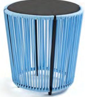
pastel blue/black/black 00ACARHT-C