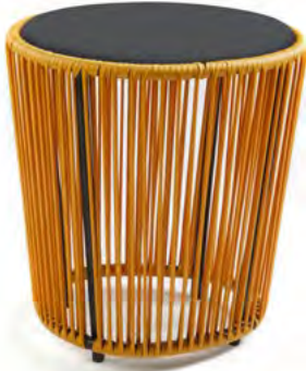
honey yellow/black/black 00ACARHT-A