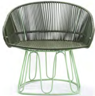
olive green/pastel green 00ACILC-A