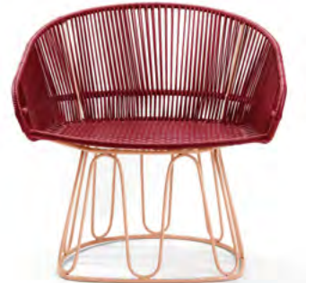
red/pink sand 00ACILC-C