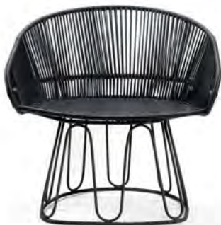
matt black/black 00ACILC-D