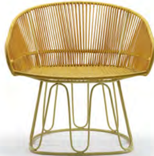
honey yellow/yellow 00ACILC-B