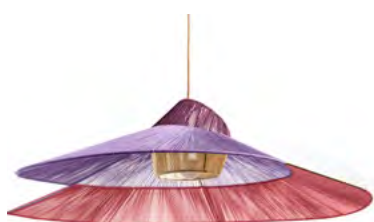
blackberry purple/mauve/ soft pink/pink beige 00AMFLS3M-A