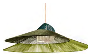
jungle green/green brown/ mint green/pink beige 00AMFLS3M-C