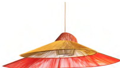
flame red/papyrus gold/ copper orange/mist grey 00AMFLS3M-B