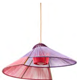
blackberry purple/mauve/ soft pink/pink beige 00AMFLS3S-A