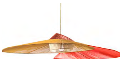
flame red/papyrus gold/ copper orange/mist grey 00AMFLS3L-B