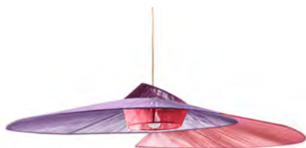
blackberry purple/mauve/ soft pink/pink beige 00AMFLS3L-A