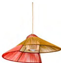
flame red/papyrus gold/ copper orange/mist grey 00AMFLS3S-B