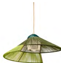
jungle green/green brown/ mint green/pink beige 00AMFLS3S-C