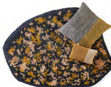
honey yellow/grey blue/beige red 00ACHIRL-2