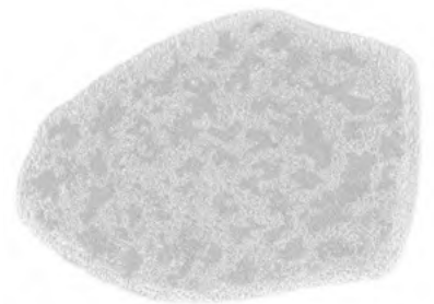
soft pink/dark green/orange 00ACHIRL-3