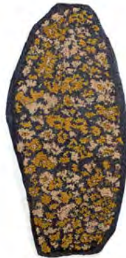
honey yellow/grey blue/beige red 00ACHIRM-2