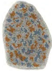
brown beige/dark grey/light grey 00ACHIRS-1