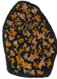
honey yellow/grey blue/beige red 00ACHIRS-2