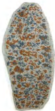
brown beige/dark grey/light grey 00ACHIRM-1