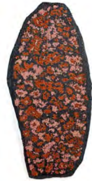
soft pink/dark green/orange 00ACHIRM-3