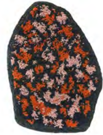
soft pink/dark green/orange 00ACHIRS-3