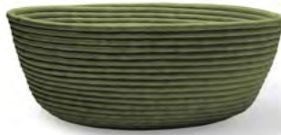
olive green 00ALAC6-2