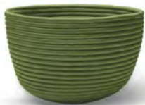
olive green 00ALAC7-2