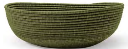
olive green 00ALAC5-2