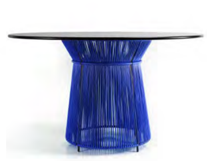
signal blue/black 01ACADT-SB1