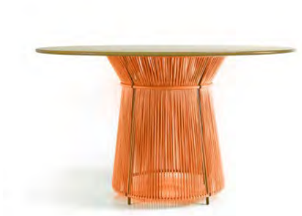
orange/curry yellow 01ACADT-CY1