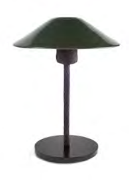
trebol green/white/black with manual switch 00ASSL-3 with dimmer 00ASSLD-3