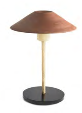
terracotta/white/natural with manual switch 0ASSL-2 with dimmer 00ASSLD-2