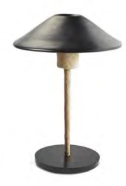
black/black/moreno natural with manual switch 00ASSL-6 with dimmer 00ASSLD-6