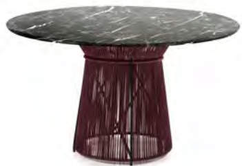
nero marquinia unito/black red/black 01ACAMD-H