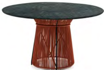
verde guatemala/copper/black 01ACAMD-K