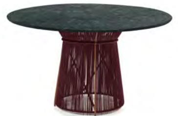
verde guatemala/black red/copper 01ACAMD-J