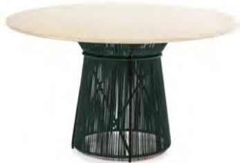
crema nuova/moss green/black 01ACAMD-F