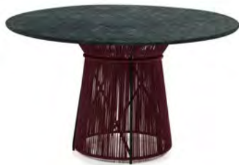
verde guatemala/black red/black 01ACAMD-I