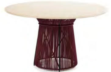
crema nuova/black red/black 01ACAMD-G