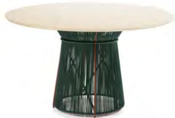
crema nuova/moss green/copper 01ACAMD-E