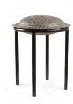
black/raw natural/black 00CAS-1