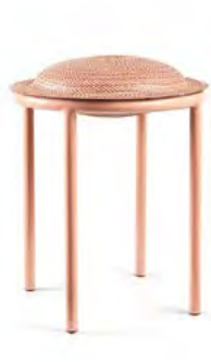
dark red/raw natural/pink sand 00CAS-12