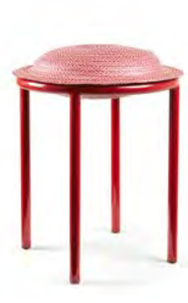
natural red/raw natural/dark red 00CAS-13