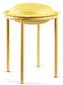
zink yellow/raw natural/yellow 00CAS-8