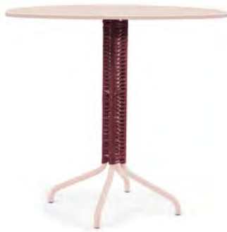
pink sand/red/ pink sand 00ACTME60-5