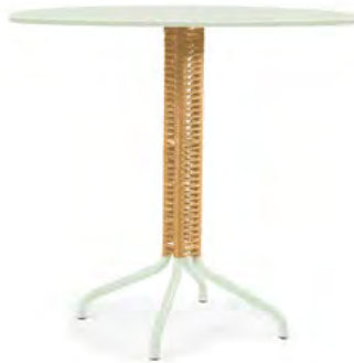
pastel green/honey yellow/ pastel green 00ACTME60-6