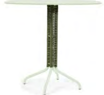
pastel green/olive green/ pastel green 00ACTME60-4