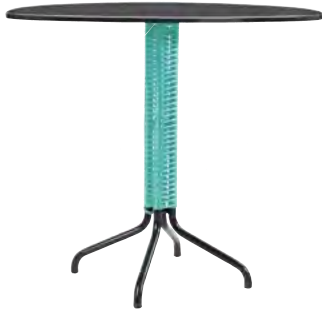
black/light green/ black 00ACTME60-2