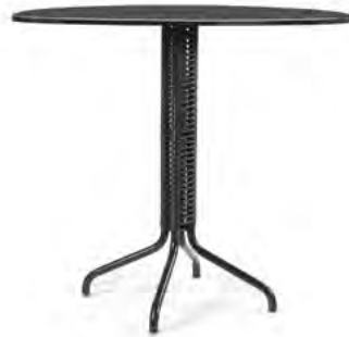
black/black/ black 00ACTME60-3