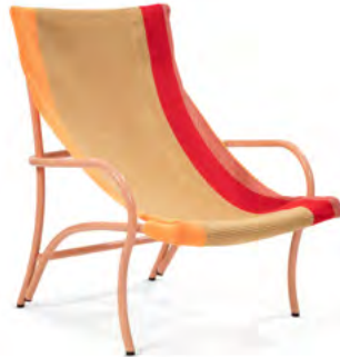
orange/gold/red/ pink sand 01AHLC-C