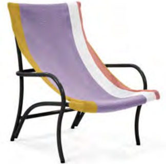
gold/purple/red/ black 01AHLC-D