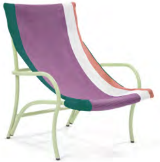
turquoise green/purple/red/ pastel green 01AHLC-A