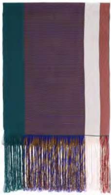
turquoise green/purple/red 00AMH1