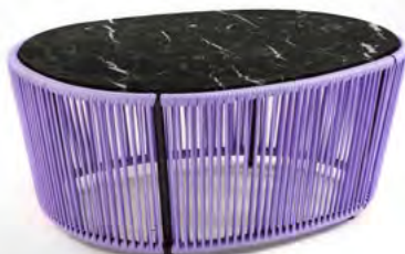
lilac/black/nero marquinia unito 00ACARLTC-D