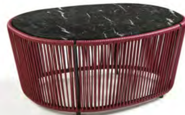
purple/black/nero marquinia unito 00ACARLTC-C