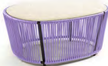
lilac/black/crema nuova 00ACARLTC-H