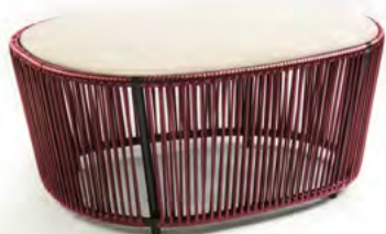
purple/black/crema nuova 00ACARLTC-G