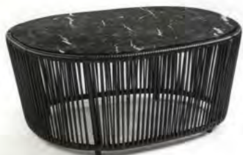
black/black/nero marquinia unito 00ACARLTC-A