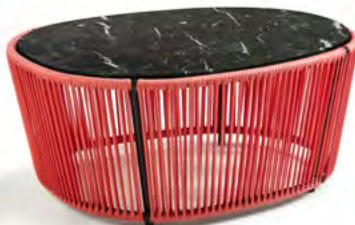
coral/black/nero marquinia unito 00ACARLTC-B