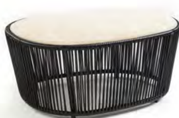
black/black/crema nuova 00ACARLTC-E