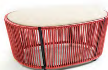
coral/black/crema nuova 00ACARLTC-F