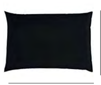
D: 600 mm