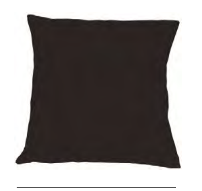
D: 800 mm