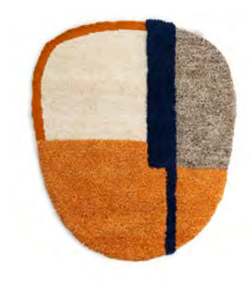
marine blue/copper brown/ochre 00ANURS33