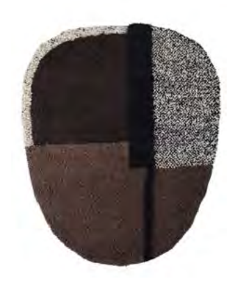
nut brown/dark brown/black/grey 00ANURS43