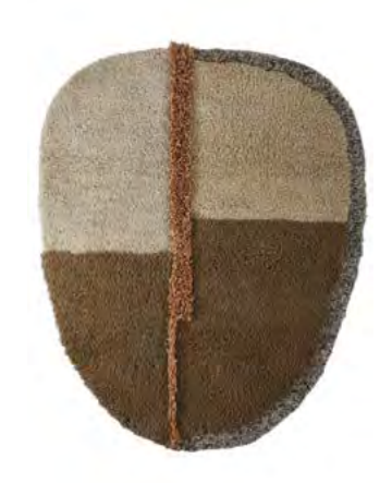
cream/beige/caramel brown 00ANURL53