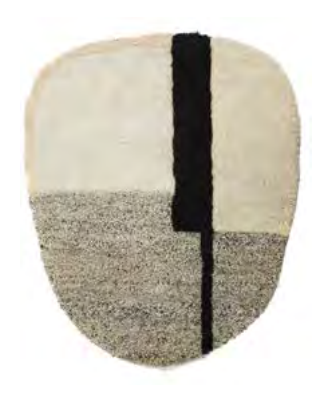
cream/beige/soft pink 00ANURS13