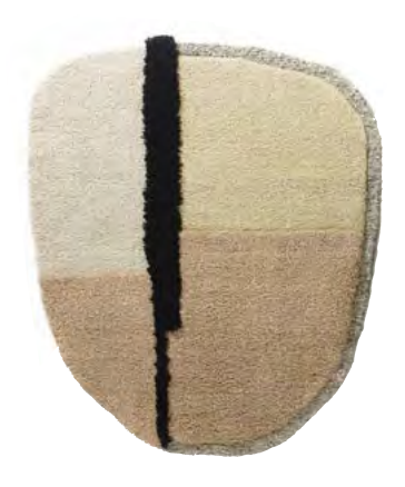
cream/beige/soft pink 00ANURL13