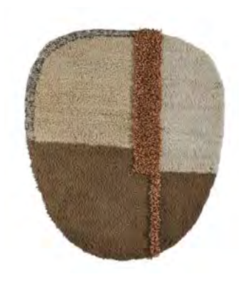
cream/beige/caramel brown 00ANURS53