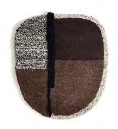
nut brown/dark brown/black/grey 00ANURL43