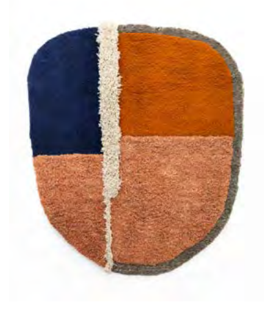
marine blue/copper brown/ochre 00ANURL33